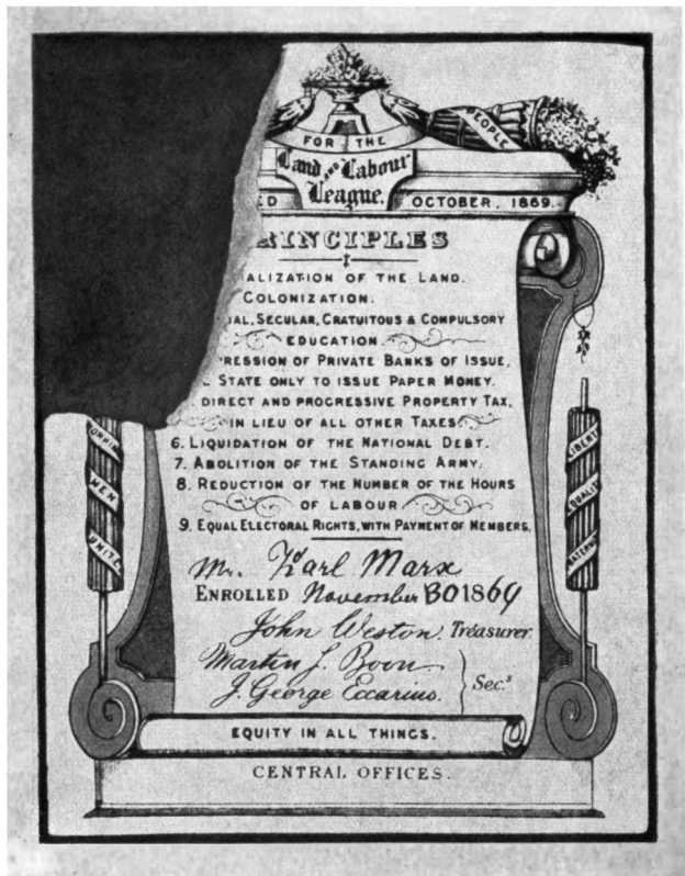
Karl Marx's membership card of the Land and Labour League